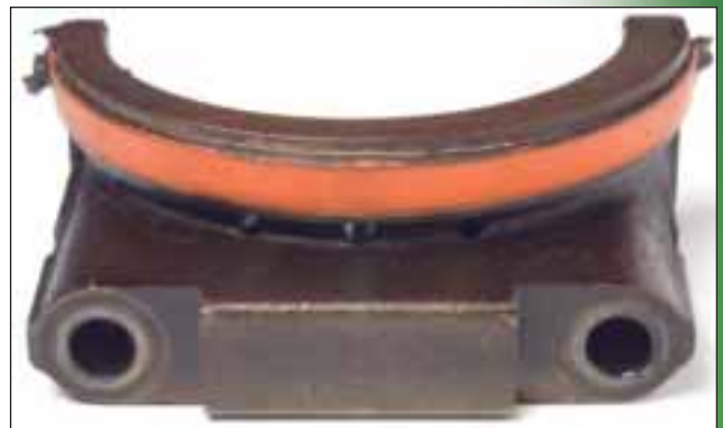
The rear main bearing cap and oil seal were in good condition. The rear seal was very pliable and still in tact, showing no signs of deterioration.