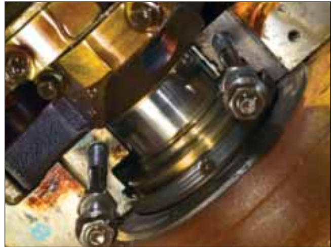
A closeup view of the rear main crankshaft journal. No visible wear detected.