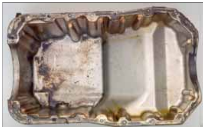
The inside of the engine oil pan was very clean. There were no sludge deposits found in the bottom of the pan.