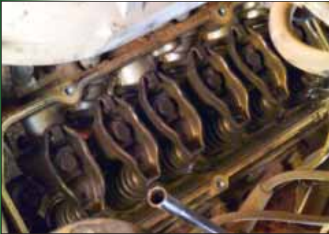
A wider view of the head and rockers. Very clean.