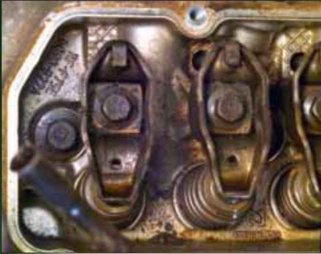
The head and rocker arms were very clean and free of heavy deposits. Note that you can still see the honey-comb stamping and manufacturer's part number. This is normally an area of the engine where you would see heavy varnish deposits with a conventional engine oil.