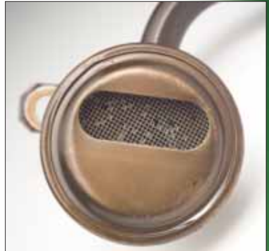
The oil pickup tube was very clean. There were minimal carbon deposits in the pickup tube screen..