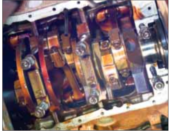
The lower crankcase area was very clean and free of any sludge deposits. The rear main bearing journal was removed showing no signs of visible wear on the crankshaft journal.