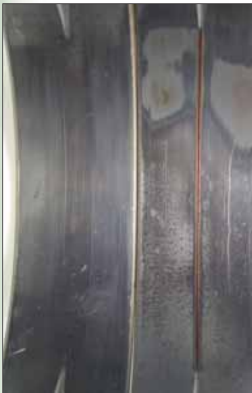
Engine main bearing halves show very little wear and are still suitable for continued use.

Each truck produces six quarts of waste-oil per oil change. With 60 vehicles being serviced every four months, that's 360 gallons per year. By switching to AMSOIL Guardian Pest Control prevents the disposal of 720 gallons of waste-oil every year. The environmental impact of this savings is enormous. It also frees up shop space that would be eaten up by drums of used oil.